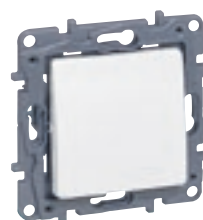
7 645 22

Mechanisms supplied with cover plates and support frames in flow-pack To be equipped with plates (p. 539) Fixing with screws or claws (supplied) Automatic or screw terminals