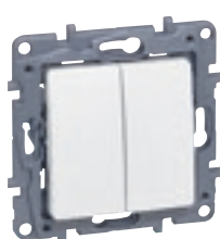
7 645 09