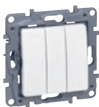
7 645 03